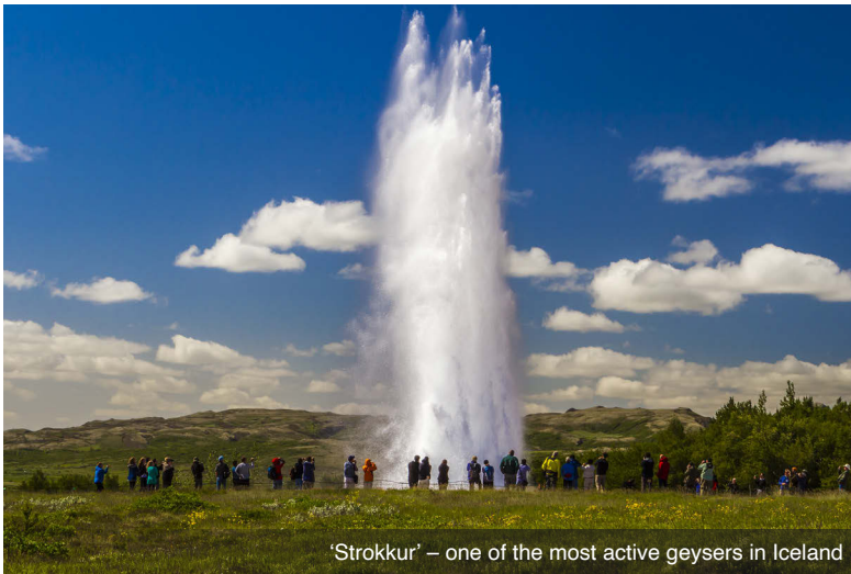
'Strokkur' – one of the most active geysers in Iceland

prepare to “take off” as you visit FlyOver Iceland. During this virtual flight, experience waterfalls, geysers, scenic landscapes, and the spectacular natural wonders of Iceland like never before. With the special effects of motion, wind, sound and scents, this unique “flying” experience is sure to be a highlight of your day! Return to the hotel late afternoon for an evening at leisure. Meal: B