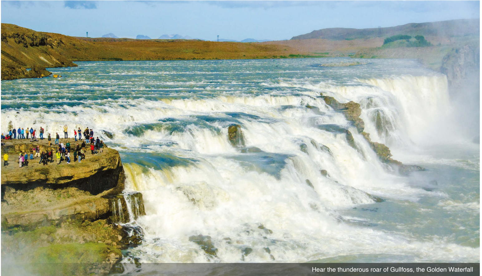
Hear the thunderous roar of Gullfoss, the Golden Waterfall