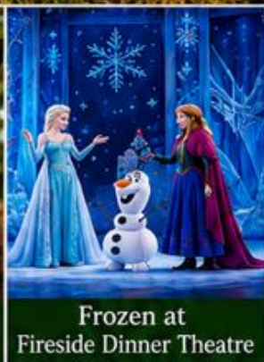
Frozen at Fireside Dinner Theatre