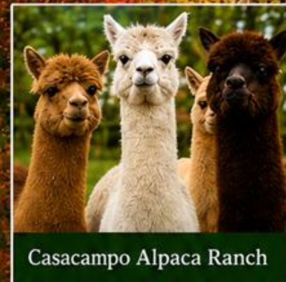
Casacampo Alpaca Ranch